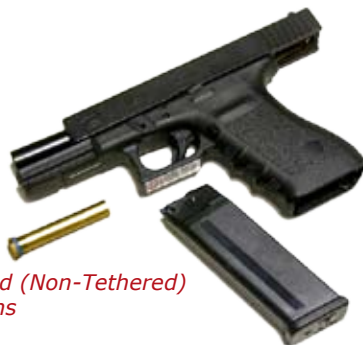
Modified (Non-Tethered) Firearms